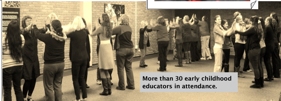
More than 30 early childhood educators in attendance.

Please join us for our Spring Workshop! Saturday May 3, 2014 10:00am-12:30pm